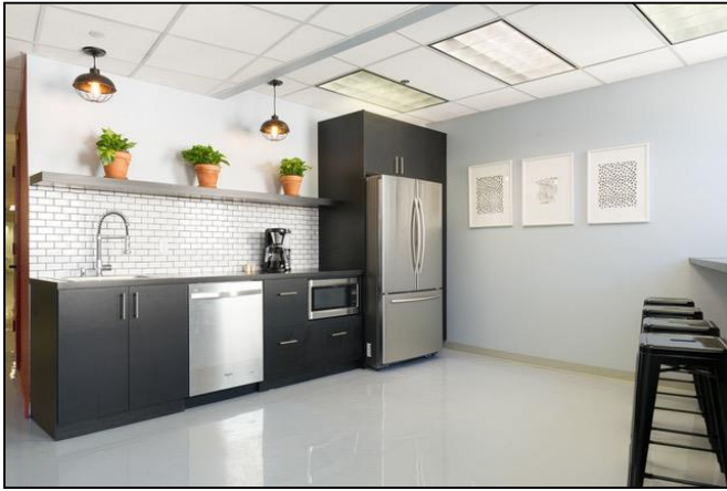
State of the Art Infrastructure