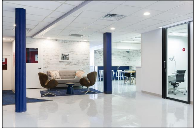
First Class Finishings Throughout