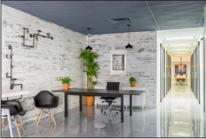
Open Air Environment